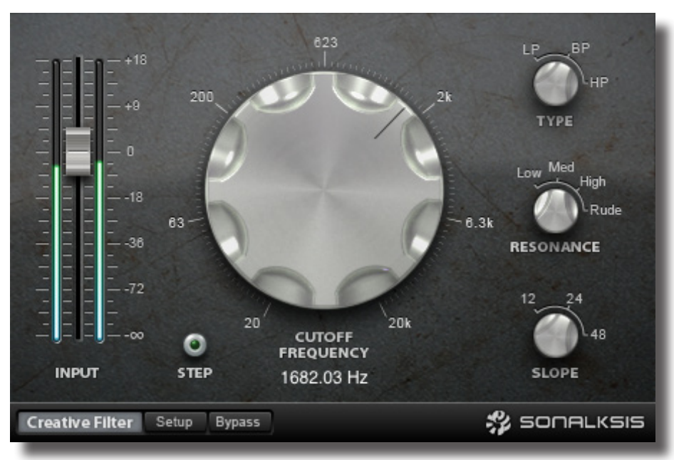
The Sonalksis Creative Filter

This guide describes the features, operation and applications of the Sonalksis Creative Filter. For detailed installation instructions, please refer to the Sonalksis Plug-in Manager User Guide . You can read more about general features common to all Sonalksis plug-ins in the Universal Plug-in User Guide .